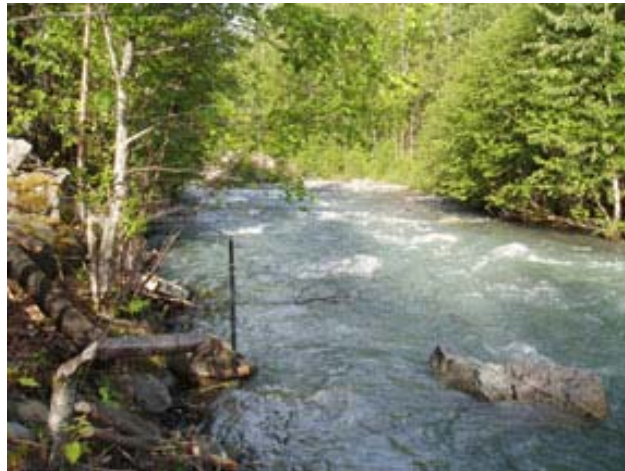
DGV Engineering Services Ltd.