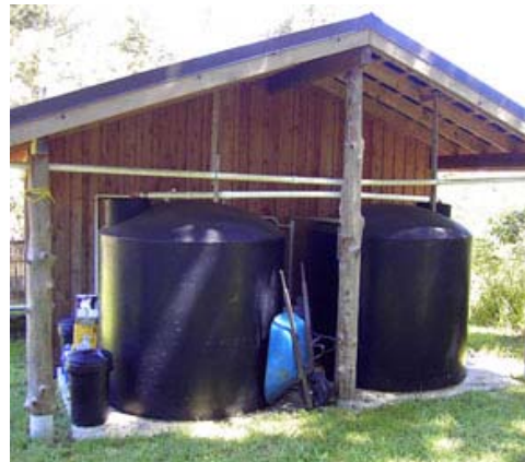
Rainwater collection cisterns (Aquarian Systems Inc.)