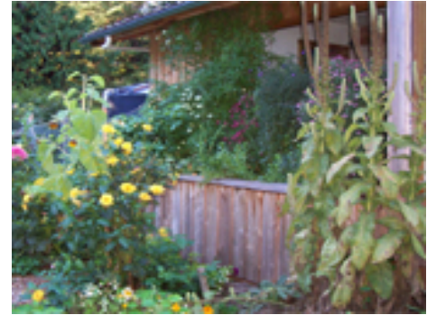
Graywater planter (Aquarian Systems Inc.)

The RDN operates seven “water local service areas” for which it manages water supplies, but there are also numerous improvement districts, volunteer water boards and private water purveyors in the Region with responsibility for providing water services. There are also several large single commercial and industrial water users with their own water systems. The RDN has no administrative or regulatory authority over these other water service providers, but wants to work cooperatively with them in achieving the Region-wide goals of efficient water use and highest standards in drinking water quality.