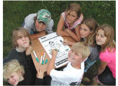
Regional District of Nanaimo

A focus of this program is to promote public awareness ‘close to home’ through neighbourhood projects and readily accessible information. For example, a water conservation group has been formed in the Fairwinds neighborhood that has proposed setting up a weather station on a private property that is linked to the irrigation system. Information from the station would assist in determining when and for how long a lawn/garden would need to be watered. These types of local projects can provide the greatest ‘bang for buck’ in achieving change in public understanding.