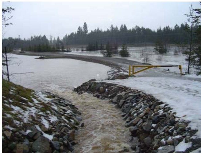
Water retention structure at River's Edge subdivision (T. Wicks)