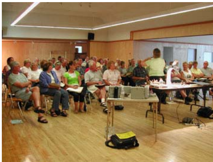
Xeriscaping workshop (Regional District of Nanaimo)

Finally, a DW-WP Committee-specific website was created for internal use by the Committee. This housed a range of resources relating to drinking water and watershed protection. The Committee’s agendas, meeting minutes and draft materials were also posted here for general reference, in addition to being distributed directly to Committee members. As a new communication tool, the website saw limited use during the life of the Committee. However, it may provide the starting point for future web-based information on the Drinking Water-Watershed Protection Action Plan.