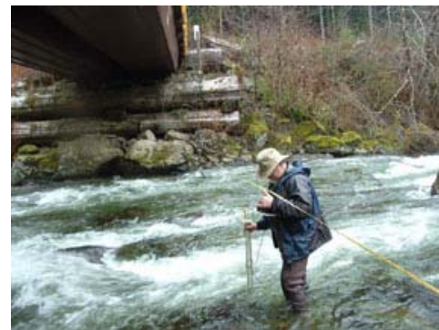
DGV Engineering Services Ltd.