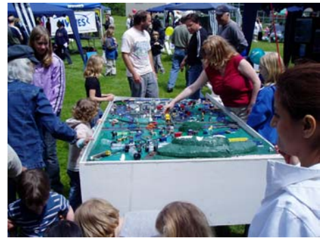
Watershed model of Parksville (Faye Smith)

There are more than 50 watersheds in the Region, as well as 30 known aquifers in coastal areas and many more unmapped aquifers in the uplands (Figure 1). It is therefore not practical to complete watershed management plans for all of these watershed and aquifers at once.