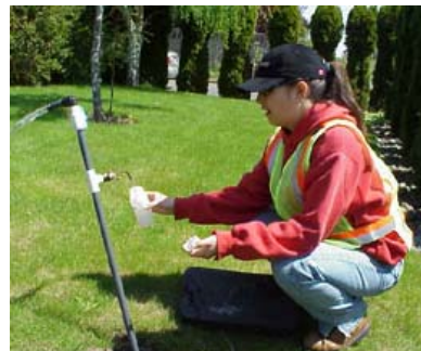
Regional District of Nanaimo

There are many aspects of water quality management – from protecting the source to keeping the distribution system and water ‘at the tap’ clean. This program is concerned with source control, as this is where watershed management plays an important role. Other RDN operational policies and practices address distribution and end-of-pipe matters. Note that inventory and monitoring of water quality are covered in Program 2.