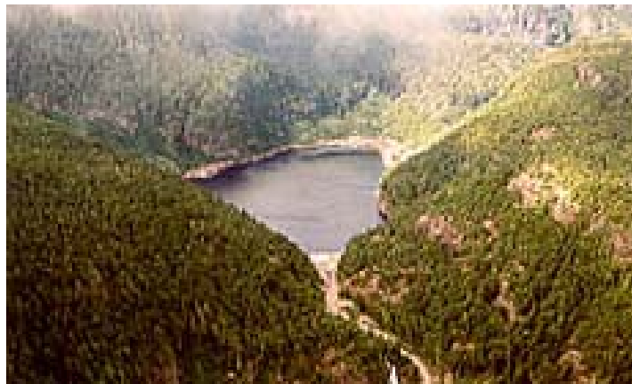
Regional District of Nanaimo