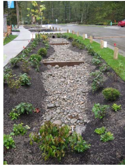
Infiltration swale (Lanarc Consultants Ltd.)