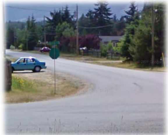
Intersection of Brittain Blvd and Poplar Way in Whiskey Creek

Very few complaints were received from the Whiskey Creek water service area in 2011. Inquiries were related to water meters, water billing, and watering restrictions.