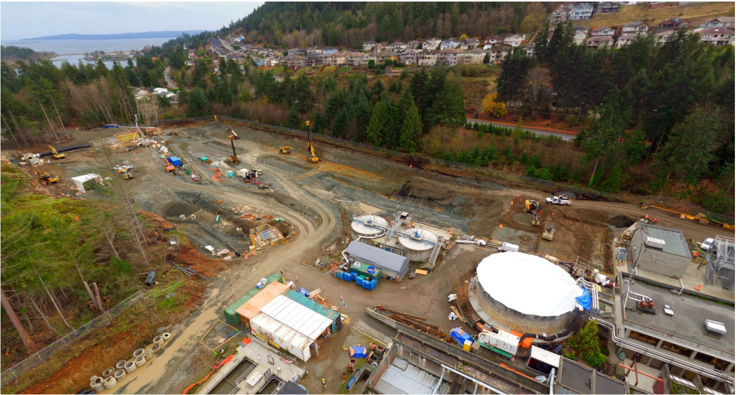
November 2017: GNPCC Secondary Treatment Upgrade Project - Stage IV Expansion Area