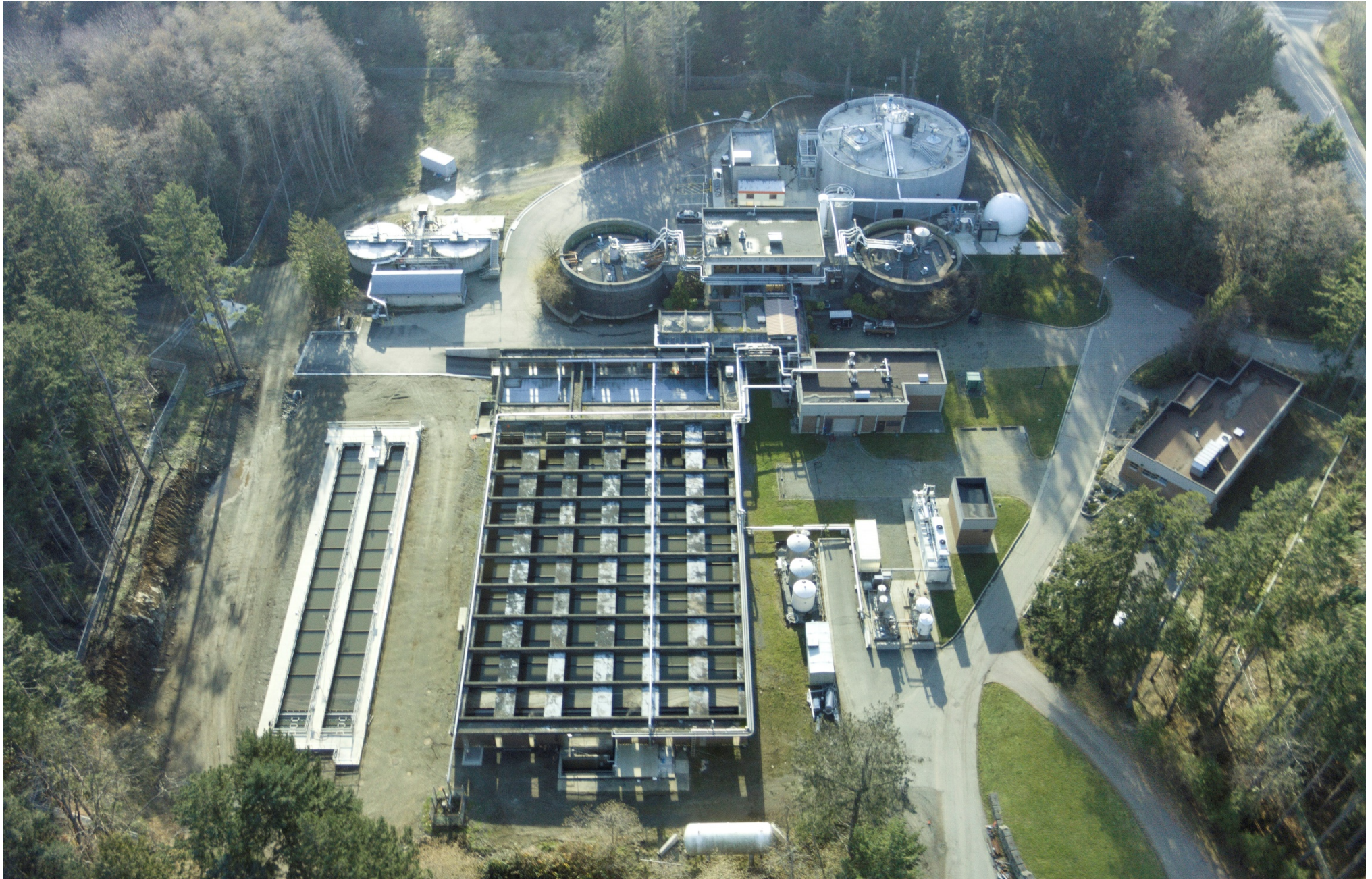
Greater Nanaimo Pollution Control Centre, 2014