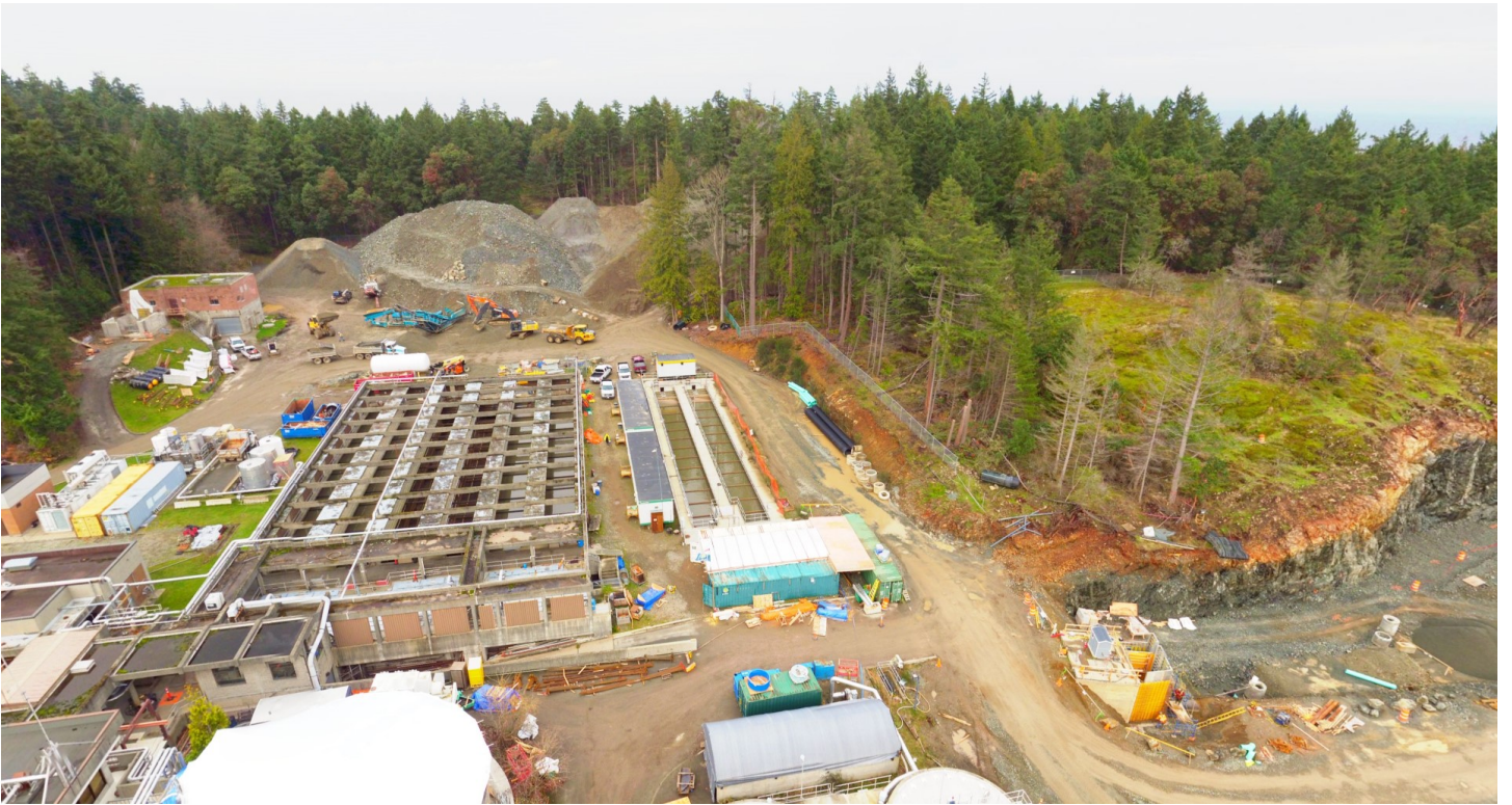
November 2017: GNPCC Secondary Treatment Upgrade Project - Local Materials Screening and Storage