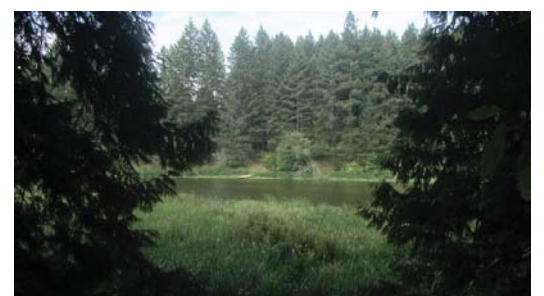
MCRT north terminus at Hemer Provincial Park.