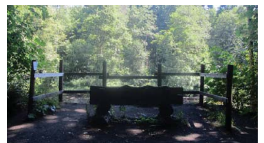
MCRT south terminus at Nanaimo River.