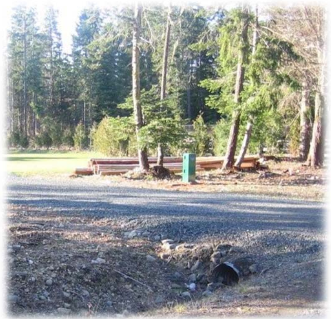
Water Sampling Station on Rascal Lane

A few complaints and inquiries were received from the Englishman River Water Service Area in 2017, and were typically related to irrigation leaks and high water bills.