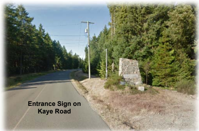
Entrance Sign on Kaye Road

An annual report for the year 2018 will be prepared and submitted to Island Health in the Spring of 2019. Annual reports are also available on our website at www.rdn.bc.ca in the SERVICES section, under “Water & Utility Services” then “WaterSmart Communities”.