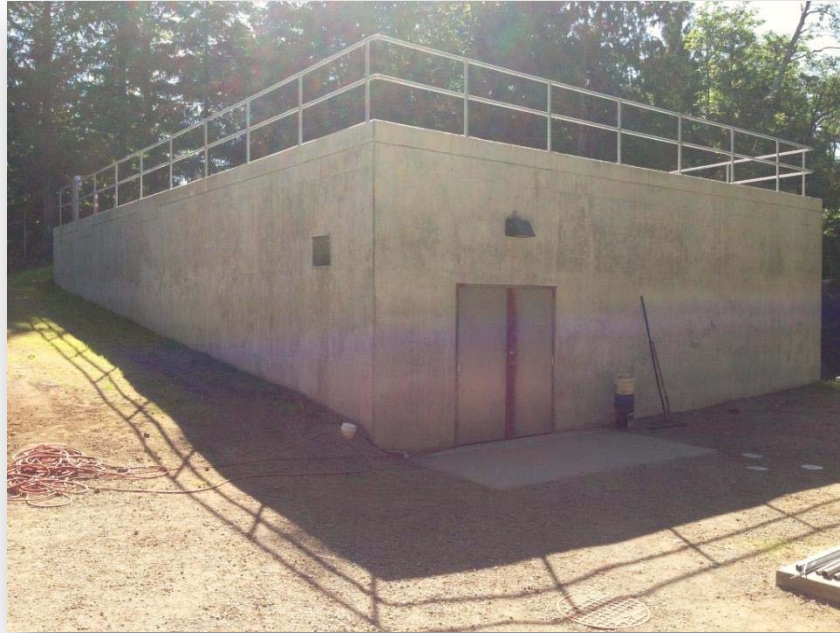
San Pareil Reservoir #2 June 2017

An annual report for the year 2018 will be prepared and submitted to Island Health in the Spring of 2019. Annual reports are also available on our website at www.rdn.bc.ca in the SERVICES section, under “Water & Utility Services” then “WaterSmart Communities”.