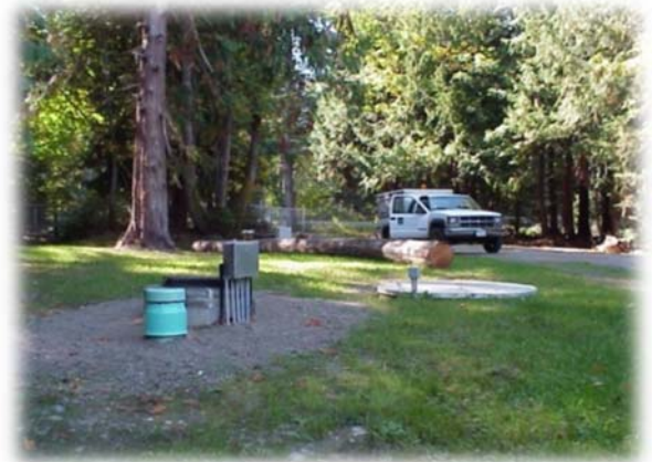
San Pareil Well Site