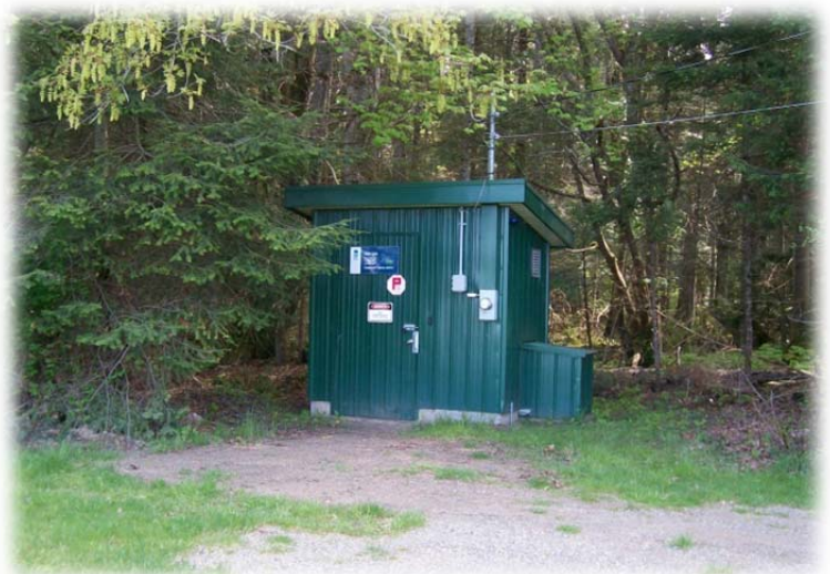
Surfside Pump house

Very few complaints and inquiries were received from the Surfside water service area, and were typically related to watering restriction times.