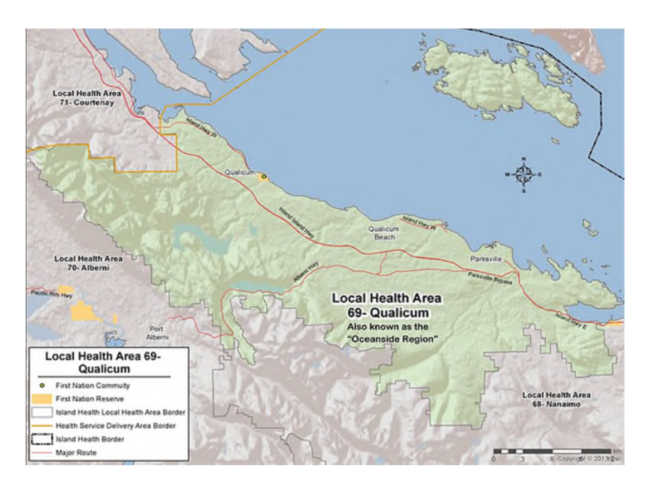
Figure 2: Oceanside Region - includes the municipalities of Parksville and Qualicum Beach and several small waterfront and rural communities stretching from Nanoose Bay to Errington, Coombs, Deep Bay and Bowser, making up four electoral areas of the Regional District of Nanaimo. Population: 45,000.

In response to this need to collectively address the determinants of health in Oceanside, a group of organizations, individuals and institutions came together in 2013 to discuss health and wellness in the region. They decided to form a group that would invite the community to identify and address health-related issues together. This group evolved to become OHWN. Members are committed to working together to enhance the health and wellness of Oceanside residents by focusing on complex issues that are best served by collective action.