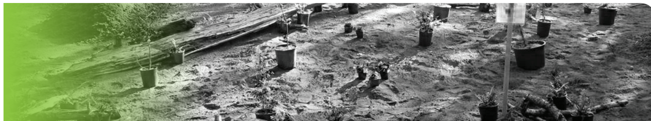
Staff and volunteers have planted 1000 native plants at Moorecroft Regional Park.

The Moorecroft Regional Park Management Plan guides the management of the Regional Park from 2013 to 2022. The plan is the result of the collaborative efforts of the residents of the Regional District of Nanaimo, Snaw-Naw-As (Nanoose First Nation), partnering organizations, RDN staff, and the Moorecroft Regional Park Advisory Committee. To view the final plan, visit www.rdn.bc.ca and click on Services/Parks/Regional Parks .