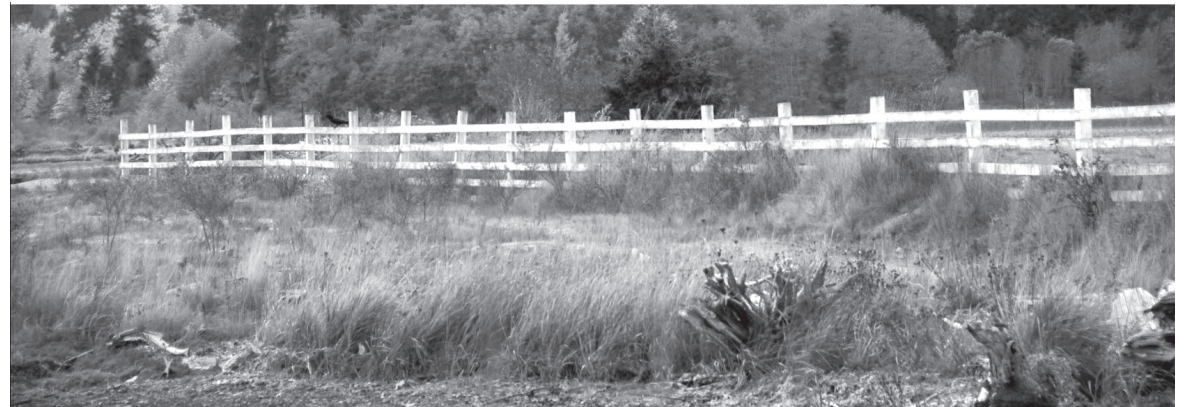
Englishman River Estuary Lands

The RDN's Drinking Water and Watershed Protection program has partnered with Vancouver Island University to update the wetland inventory for the region. Student researchers are on the ground collecting data for the inventory to improve our understanding of wetland dynamics and identify significant groundwater recharge and discharge areas. Across the RDN, the inventory will be used to inform regional land use planning, ensuring protection of groundwater resources and wetland ecosystems.