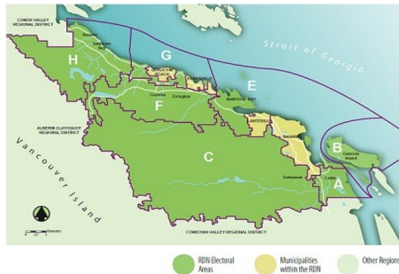
Figure 2 Electoral Areas in the RDN

The RDN covers an area of approximately 207,000 hectares on the southeast coast of Vancouver Island. The RDN includes four incorporated municipalities and eight unincorporated electoral areas. A map of the RDN is provided as Figure 2.