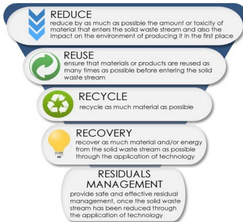
Figure 1 Waste Management Hierarchy adopted from the BC Ministry of Environment

The future solid waste system will build on the existing framework of services and programs while seeking to improve the delivery of those services and continue to reduce the quantity of waste sent to disposal. The proposed programs, infrastructure and policies for the updated Plan are outlined in Sections 4 through 5 of this report and are presented in accordance with waste management hierarchy as shown in Figure 1.