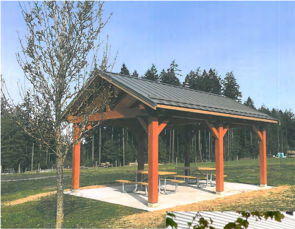
Figure 3b. Picnic Shelter, Arbour and Lattice Options.