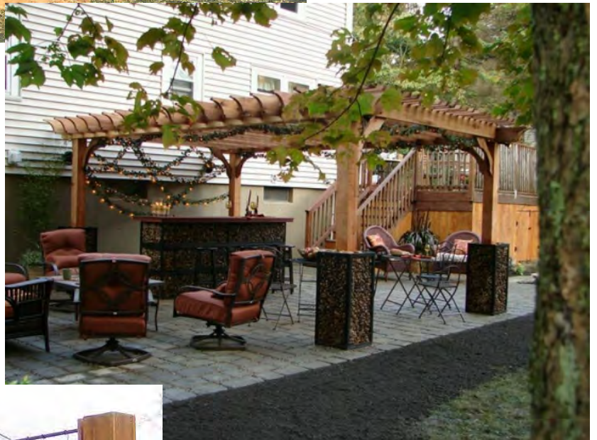
Arbour Option for grape vine