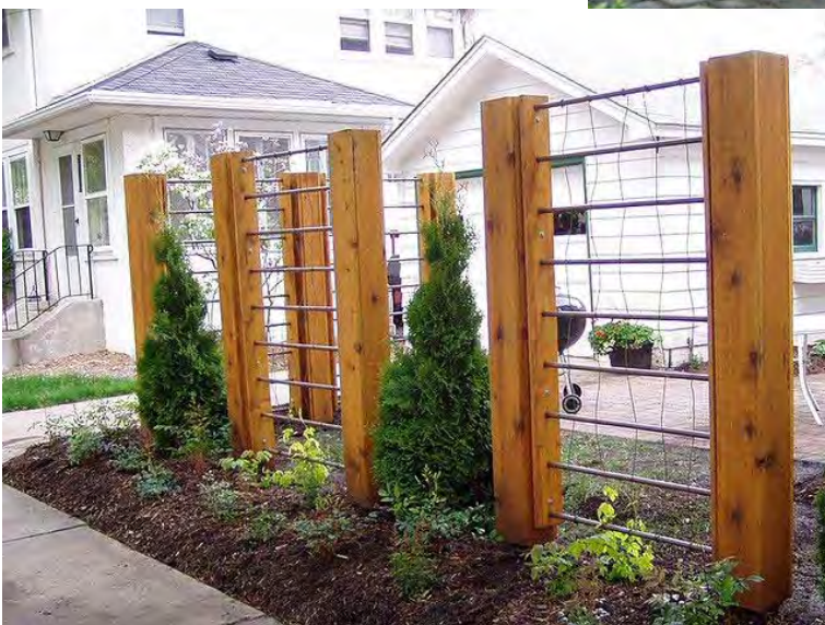
Arbour Option for grape vine