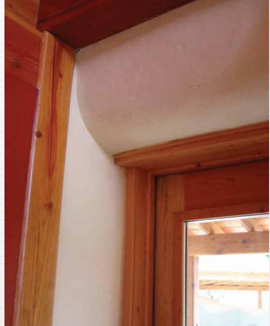
step 2/3: finish coat & clay paint