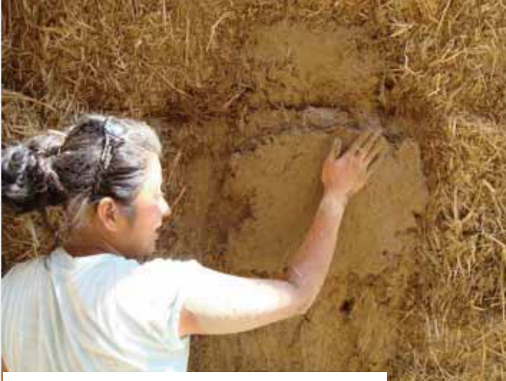
step 1: bodycoat